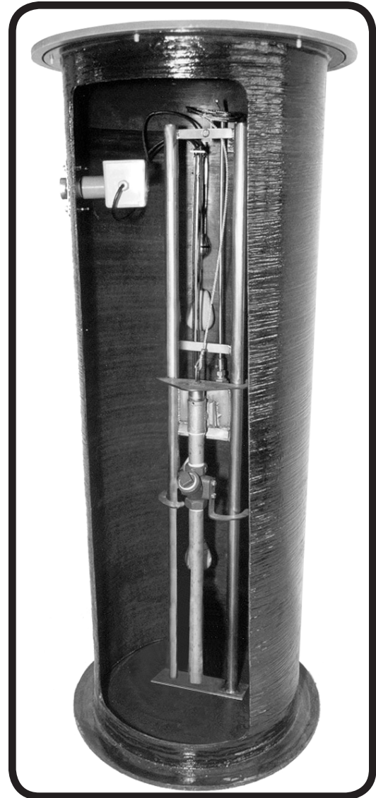
Simplex Grinder Package 24" Dia. Various Depths 1-1/4" Discharge For 2Hp Grinder Pumps

Other sizes and configurations available by quote only.